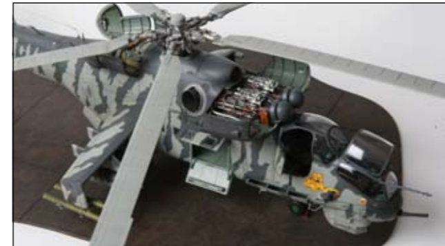
Mil Mi-24V Hind E