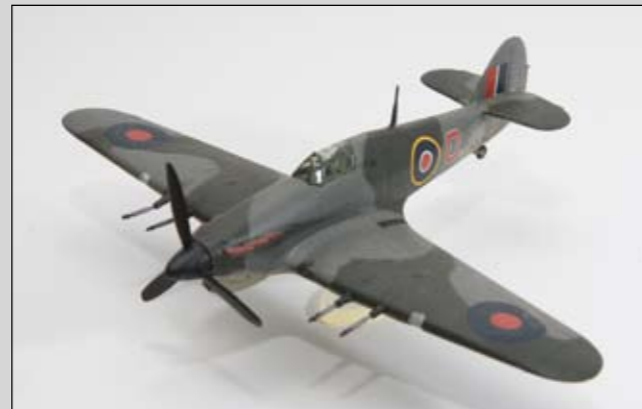
Abbey Tiernan Hurricane IIC