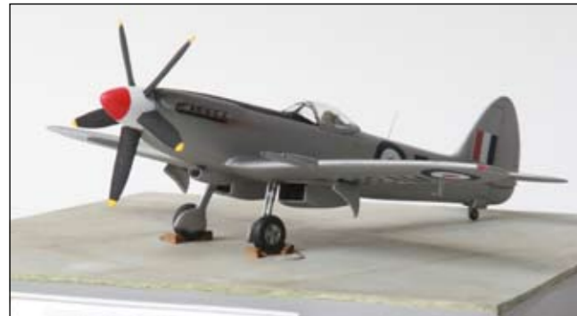
Ian Vale Spitfire Mk24