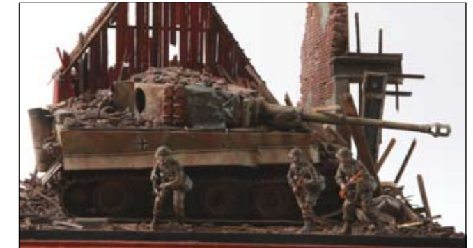
Matt Beattie Tiger '111' Villar's Bocage