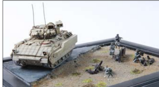
Bryce Parlanti US Army M2A3 Bradley Tank diorama