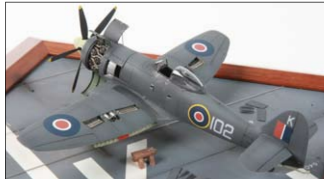
Paul Gloster Hawker Sea Fury F10

Sponsored by Australian National Aviation Museum