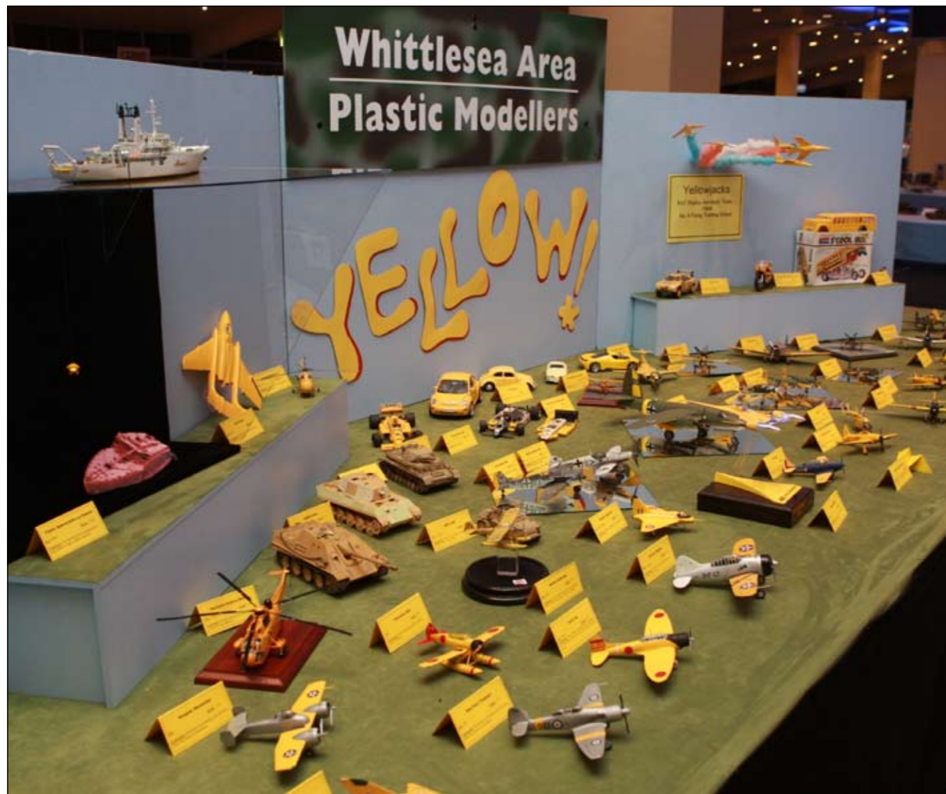
Whittlesea Area Plastic Modellers 'Yellow!'