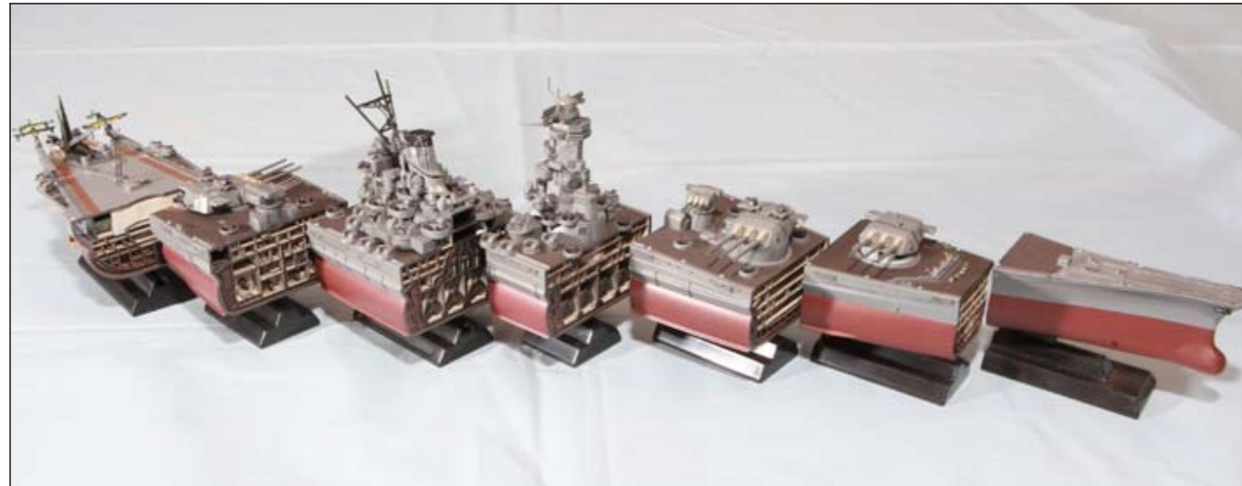
Clayton Fiander IJN Yamato